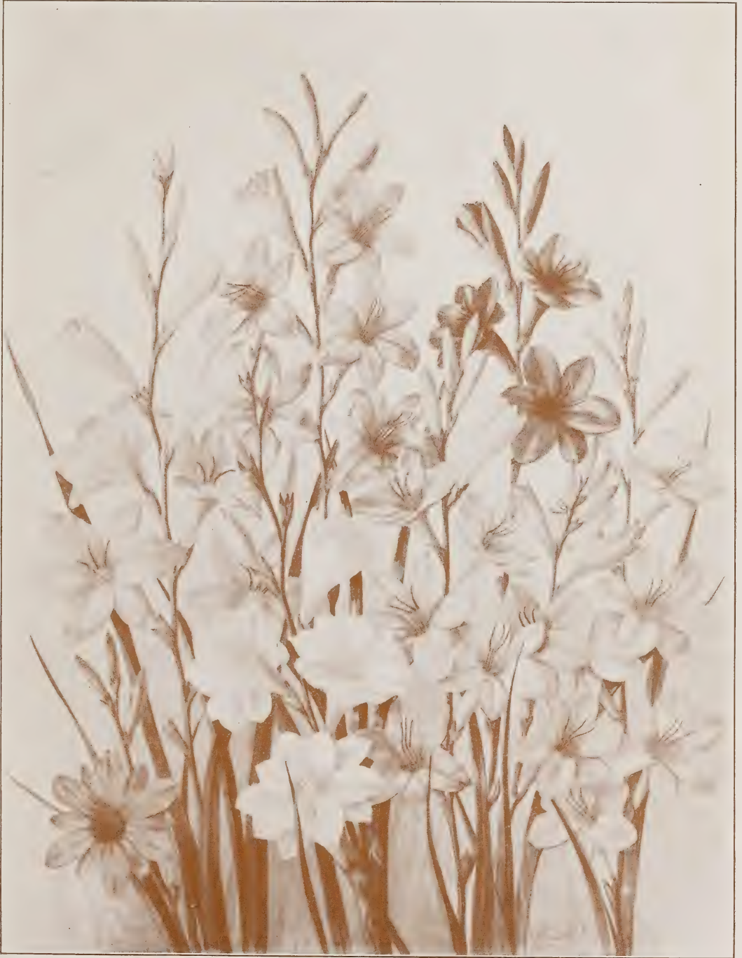
Burbank's Watsonia Hybrids. New Types, New Colors, Enormous Flowers. Double and Single.

"The greatest service which can be rendered to any country is to add a useful plant to its culture."—Thomas Jefferson.